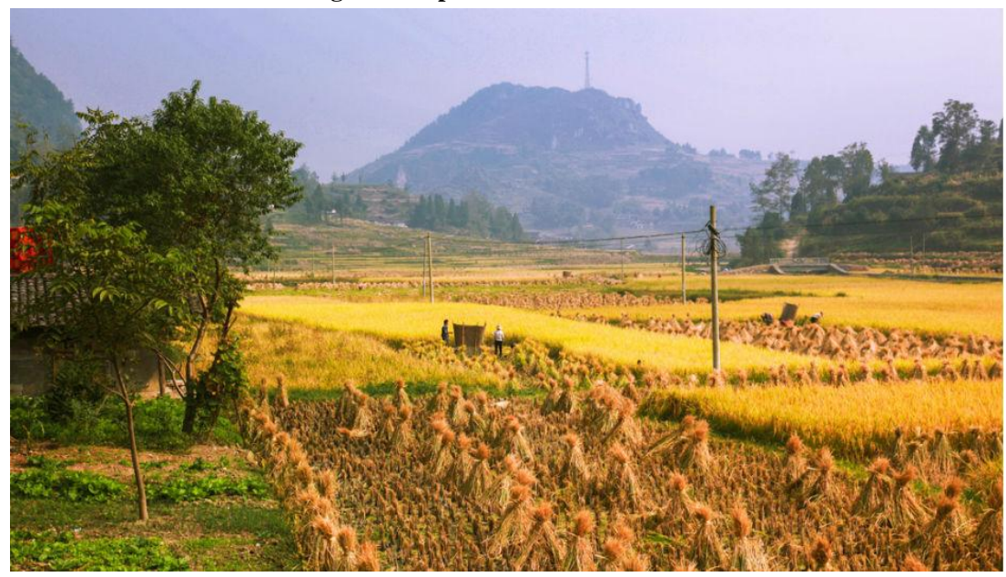
Ping Ba Camp Tourism Area (坪坝营)

Ping Ba Camp Tourism Area combines ancient, odd, elegant, quiet, wild and other scenery, which enjoy a strong original flavor for the salient features. Also, it is the largest virgin forest community in the Midwest.