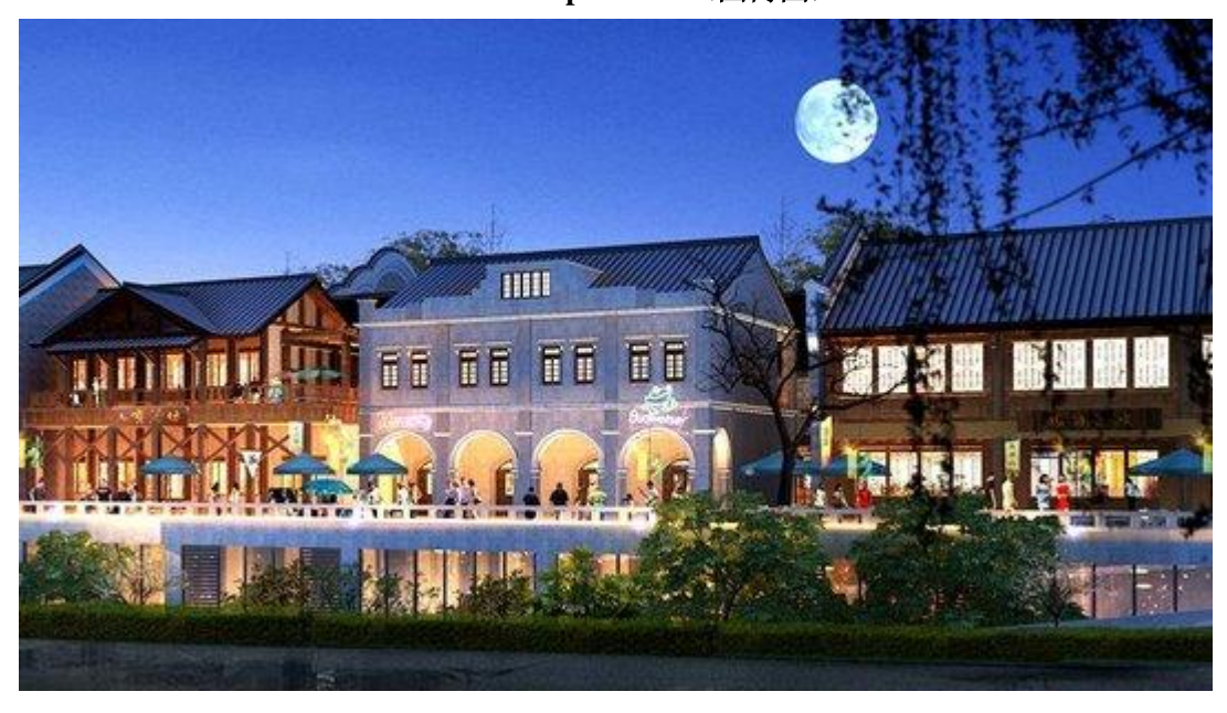
Garden Exposition (园博园)

Located in Hankou, Wuhan, Garden Exposition is a big and good-looking park with many beautiful trees, flowers and great lakes. It vividly shows the traditional Wuhan style and features.