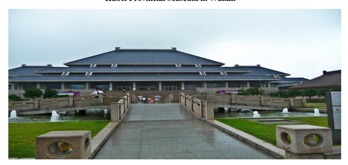
Hubei Provincial Museum in Wuhan

The center for collecting, studying, preserving and displaying historical and cultural relics in Hubei, especially famous for its collection of ancient relics from the tomb of marquis Yi of Zeng.